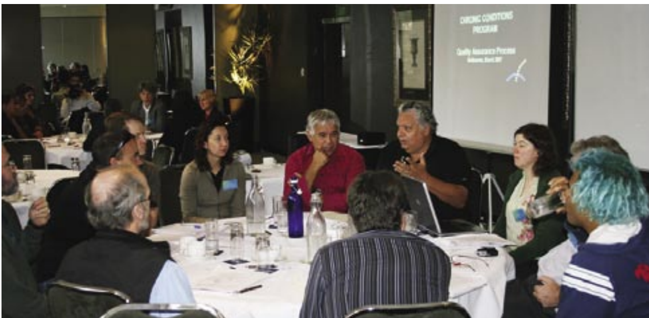
A Quality Assurance workshop held in Melbourne as part of the development of the Mibbinbah (Men's Places) project

Mibbinbah can be thought of as two distinct but related projects. The first is a pilot project which seeks to evaluate existing Indigenous men's sheds/spaces through the employment of local Indigenous male Project Associates. These Project Associates will be trained in the use of participatory action-research methods that will help in developing and sustaining these sheds/spaces during the research program. Further training in Indigenous leadership, community communication and media, and computer and internet